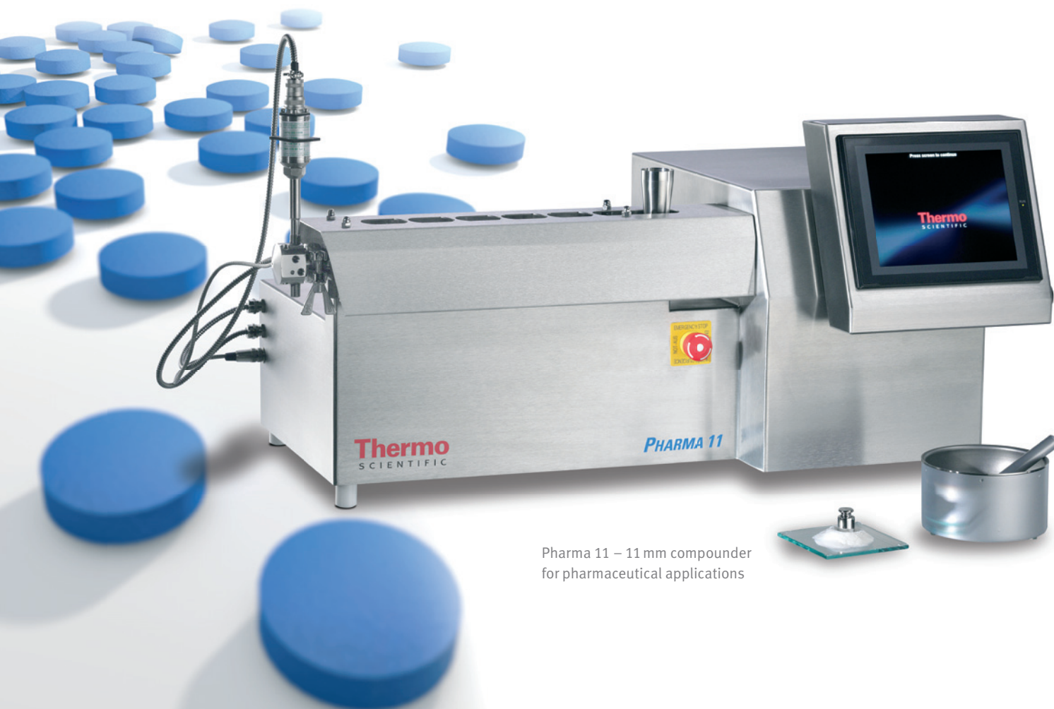
Pharma 11 – 11 mm compounder for pharmaceutical applications

The barrel of the parallel co-rotating twin-screw extruder has an L/D ratio of 40:1. With the screw length adaption kit significant flexibility is provided in enabling the barrel length to be adjusted to suit the application.