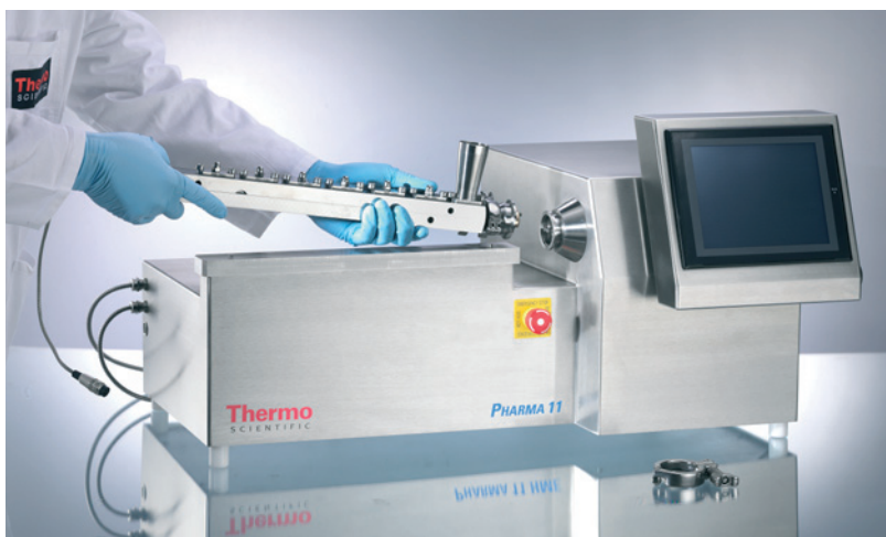
Easily remove and replace the barrel of the Pharma 11

Testing of different formulations and associated validation documentation is quick and easy. High resolution torque measurement and PAT measurements such as FTIR are additional options easy to integrate.