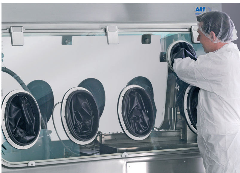
Thermo Scientific Pharma 11, the perfect fit for isolator applications

With the unique monocoque, fanless design complete with electronics fully integrated into the unit itself, no additional cabinet is required and the unit can simply be rinsed with water (IP54) to avoid any dust formation.